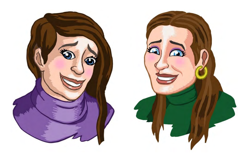
"I won't drool," says Tish. "Okay," sighs Voltaire. "Let's cuddle."