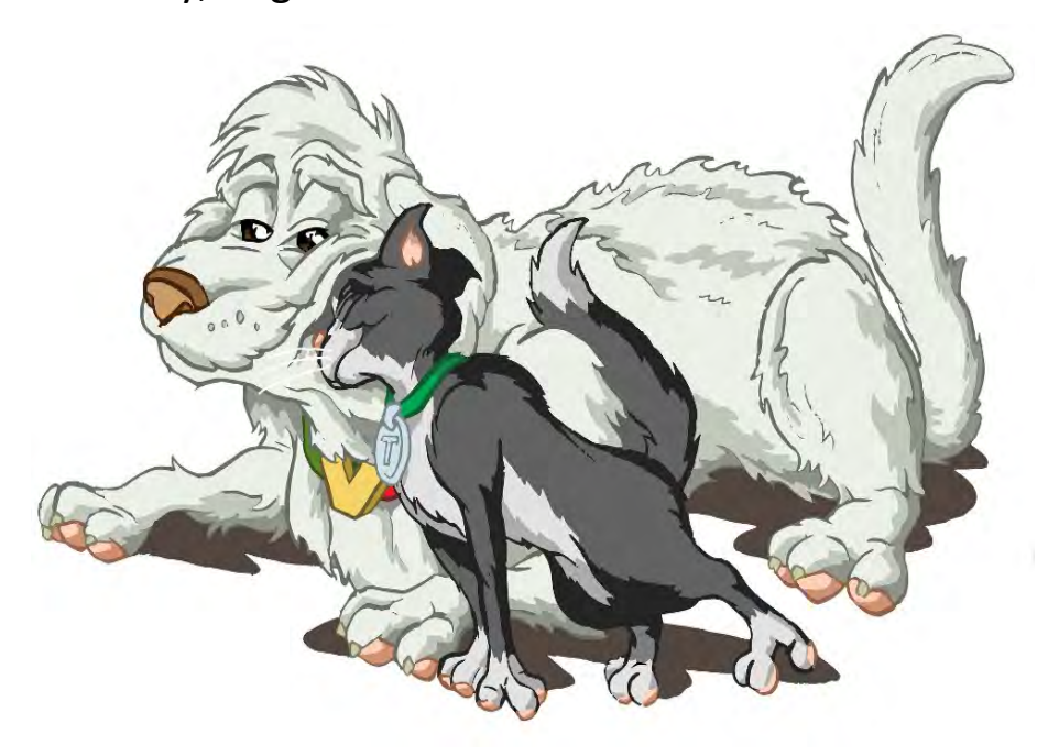
"You're a true friend, Voltaire," says Tish.